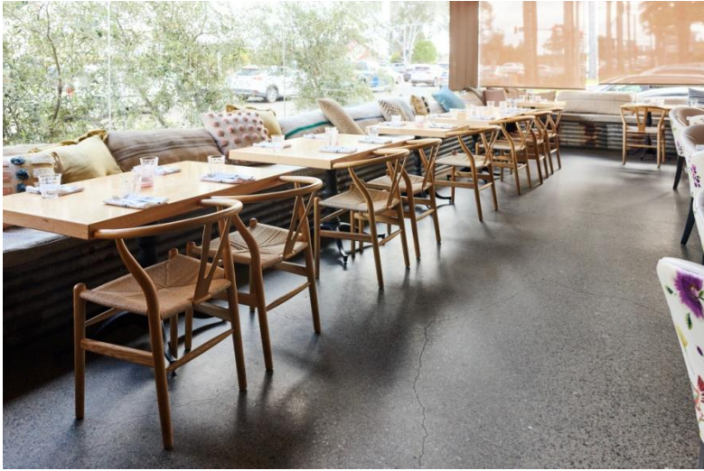
west dining room (glass dining room) for parties up to 78 guests