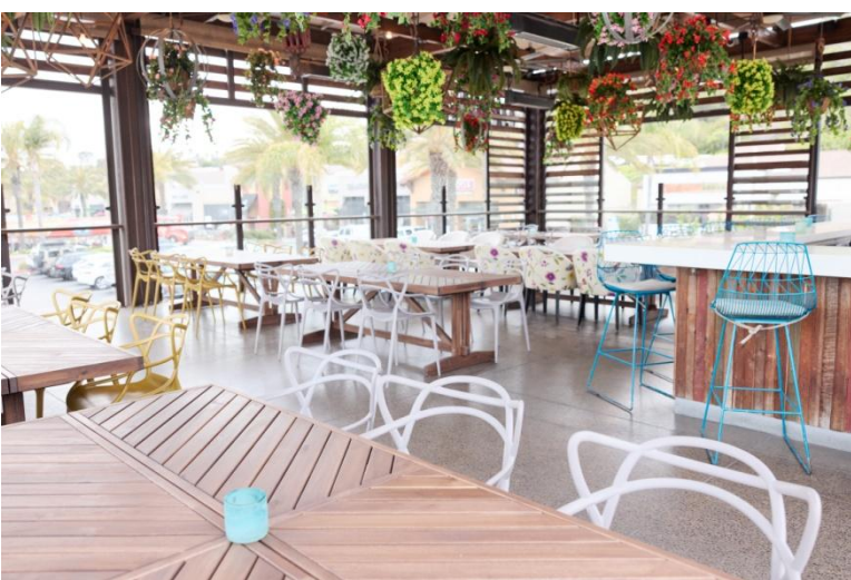
garden patio private event space for up to 54 seated | 70 reception