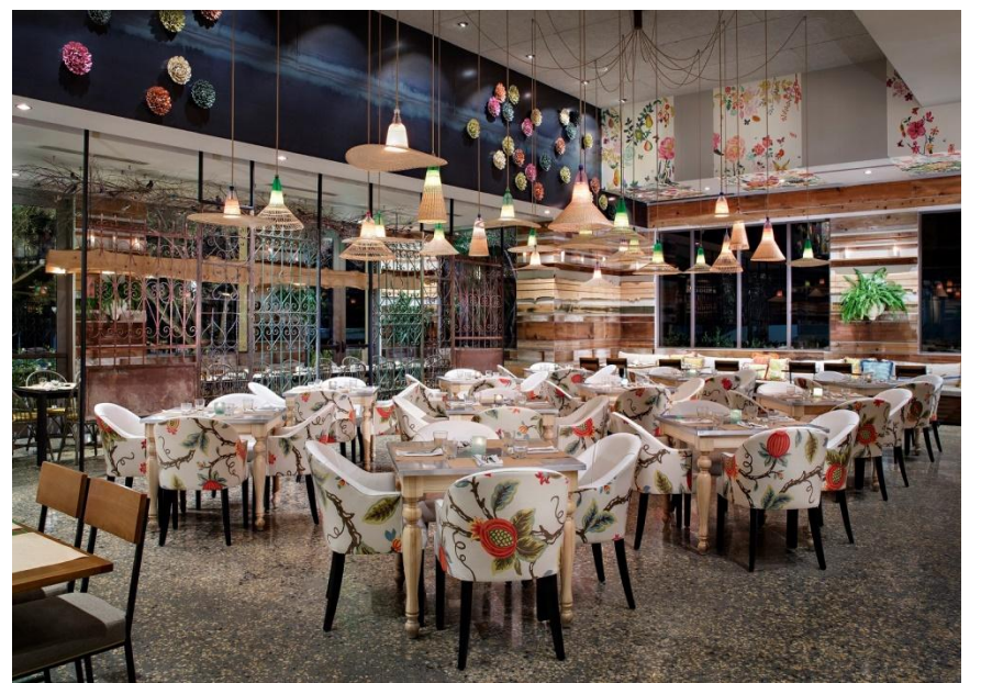
dining room buy out (semi private) for parties up to 100 guests