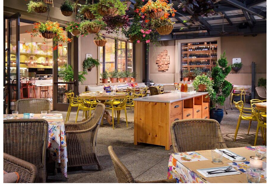
main patio buy out (private) for parties up to 72 guests