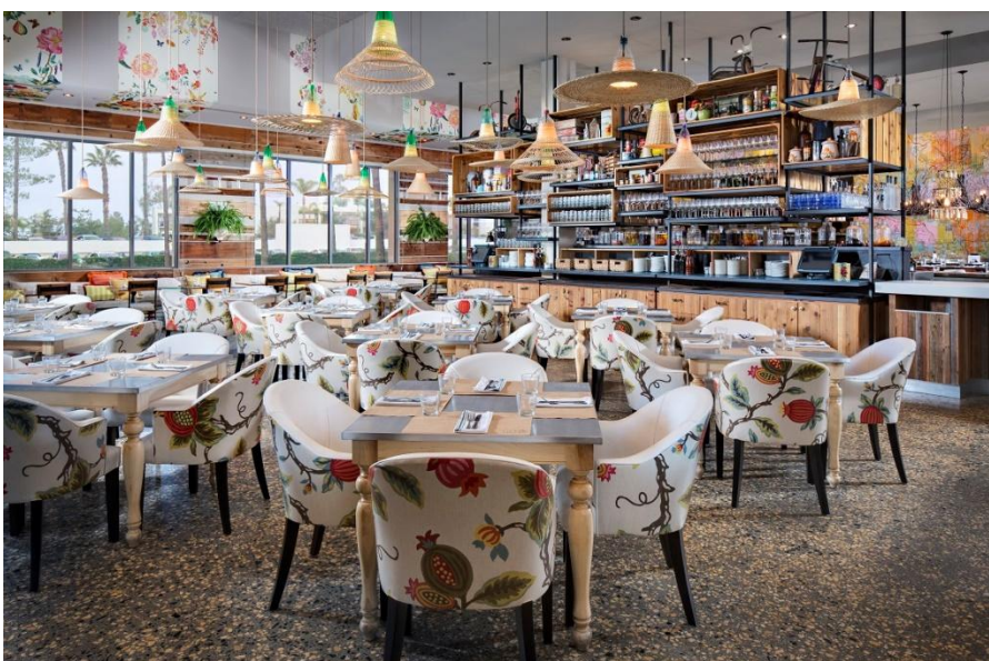
dining room banquette seating (not private) for parties up to 32 guests